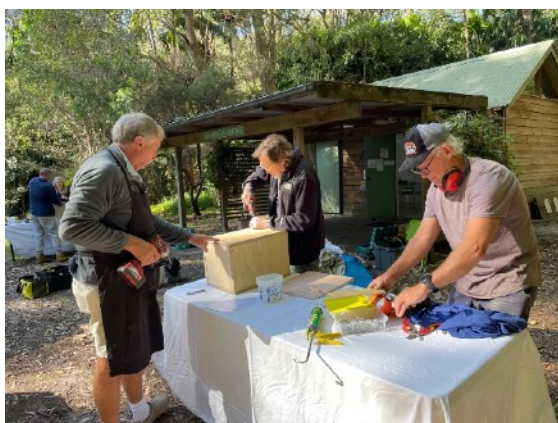
Nestbox Workshop at the Arboretum