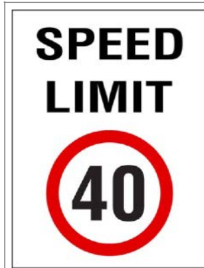
Village speed limit