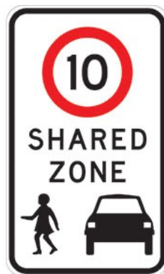
Café and Pearl Parade Shared Zone

Pearl Beach Progress Association's letter of 28 September 2022 to Central Coast Council proposing a 40KM and 10KM shared zone speed limit remain under consideration.